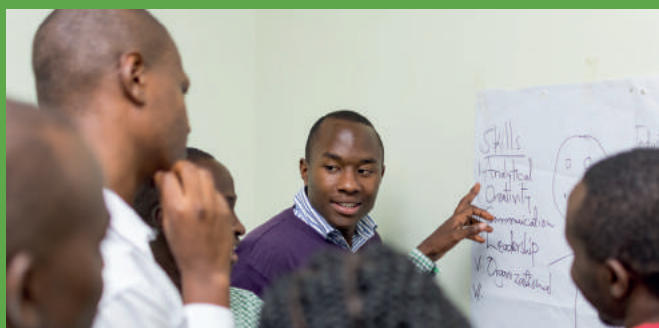
Participants discussing diverse life skills.

Here are pictures from the very first session that was held physically at the Bank's Leadership and Management Centre (LMC). Due to Covid, the sessions are now held online. For those who have completed High School, please email or call us using the details at the back, to learn more and join the next Class of 2023. Karibu Jijali.